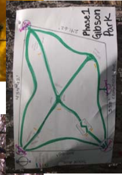
Over 40 volunteers made the first Gibson Park Cleanup a success!